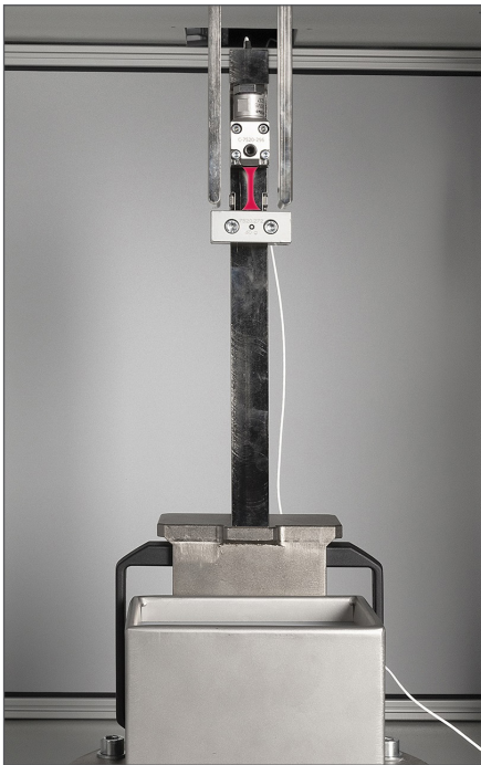
Vice and Tup for tests on Plastics

Static machines, primarily used for tensile tests, cannot reach moderate or high velocities and the only alternative for testing at high-speeds is to use servo-hydraulic testers. Since these systems often require significant support infrastructure and maintenance, the Impact Drop Towers of the 9400 Series can be a valuable option.